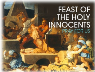
FEAST OF THE HOLY INNOCENTS PRAY FOR US

Meanwhile the Holy Family was warned by an Angel to flee into Egypt. King Herod fell into a jealous rage over the Magi's failure to report back to him. He ordered all the baby boys aged two years and under to be killed, according to the appearance of the Bethlehem Star to the Three Wise Men, in an attempt to kill the Baby Jesus. These baby boys died not only for Christ, but in His stead. The Church venerates them as martyrs. It is uncertain how many children were killed, whether a small number, or in the thousands. The Latin Church instituted the feast of the Holy Innocents in the fifth century. The Basilica of St. Paul Outside the Walls in Rome is believed to possess the bodies of several of the Holy Innocents. Their feast day is commemorated on December 28th.