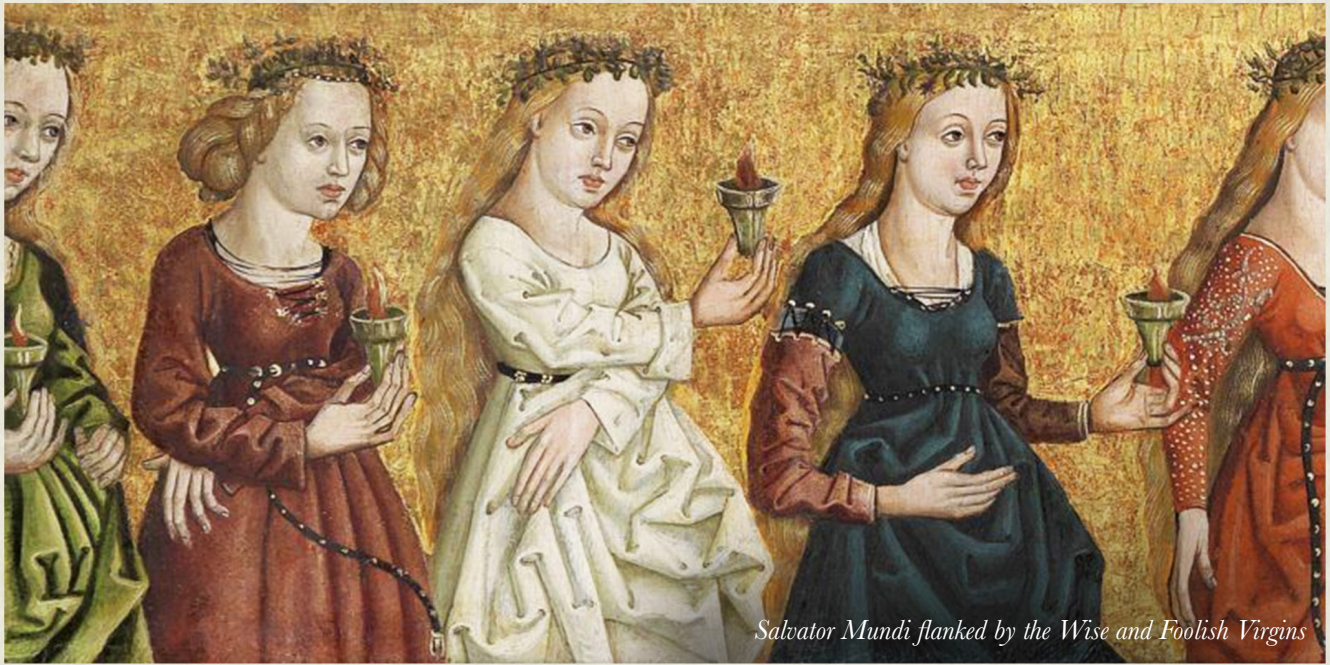
Salvator Mundi flanked by the Wise and Foolish Virgins