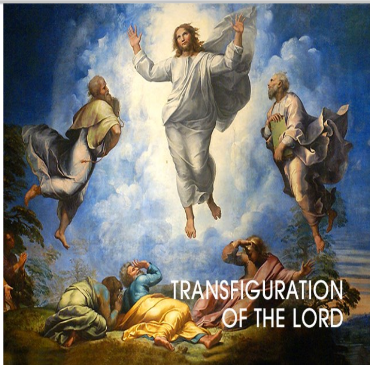
TRANSFIGURATION OF THE LORD