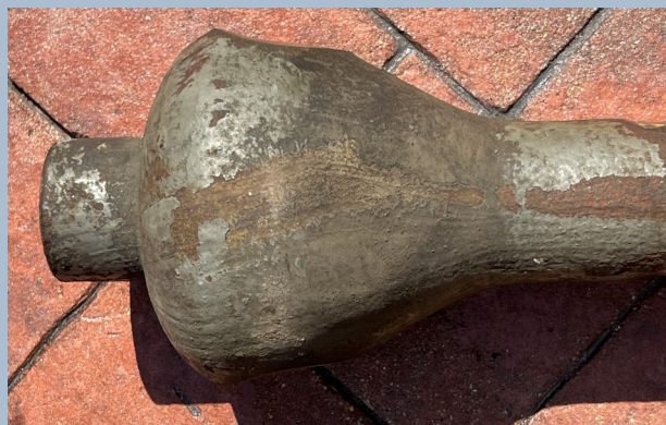
Close view of The Ball on the end of the clapper