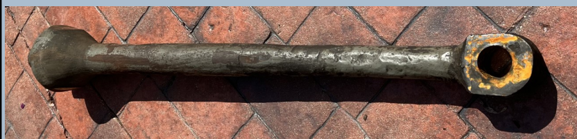
Entire Length of Clapper