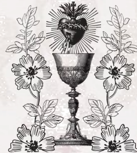
MOST PRECIOUS BLOOD of JESUS PARISH

PARISH NEWS —The parish uses Flocknote to circulate news and information. If you’d like to sign up, please text MPBOJ to 84576 from your cell phone and follow the instructions, or check the parish website ( MPBOJ.com ) for more information.