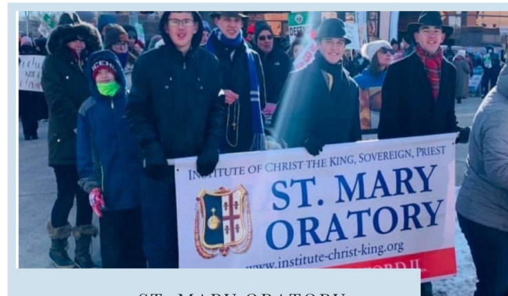
ST. MARY ORATORY