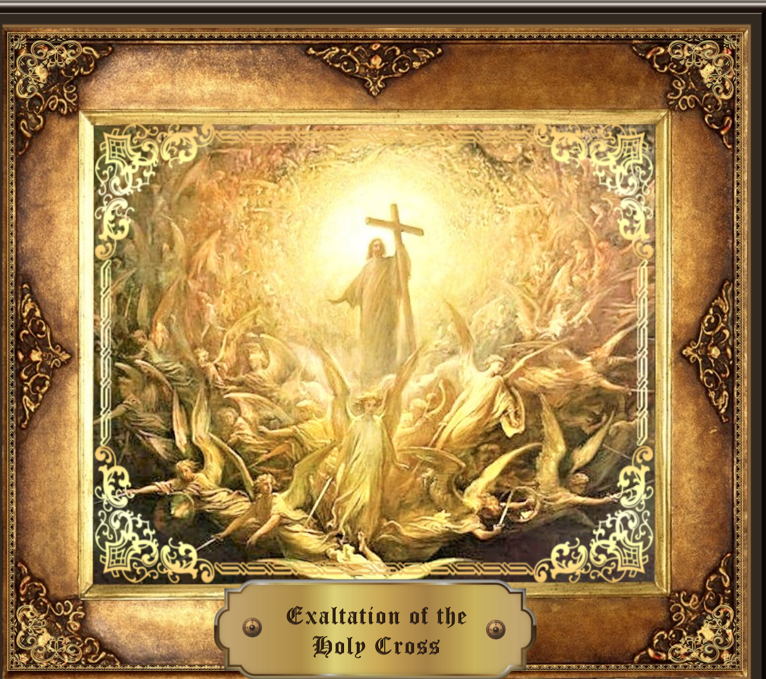
Exaltation of the Holy Cross