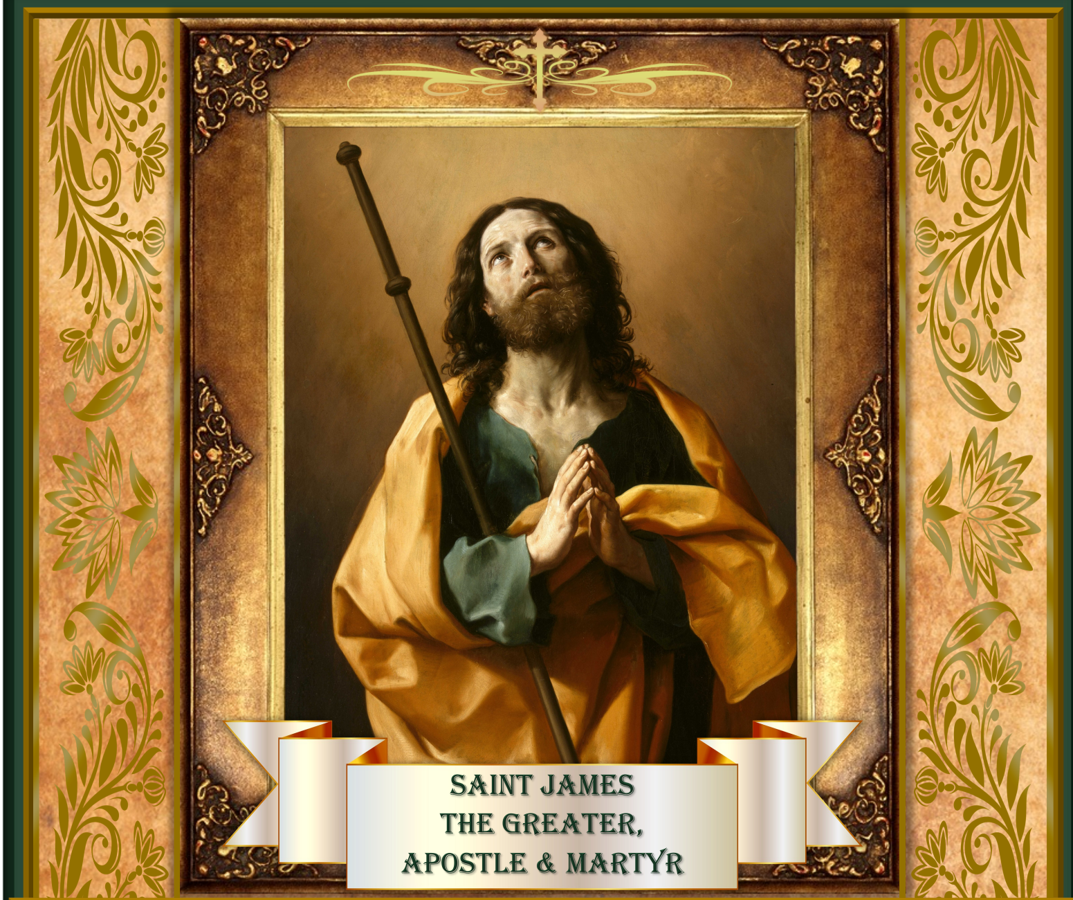
SAINT JAMES THE GREATER, APOSTLE & MARTYR