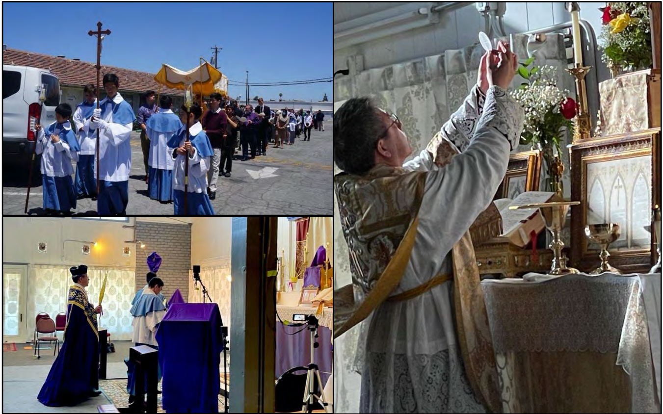
Above: Procession at the shopping plaza and indoor Masses

Meanwhile, it became less possible for us to move back to Five Wounds parish. An Arabic Catholic community began using the chapel on Sundays. Our not being able to offer Sunday morning Masses at the chapel would make it difficult for us to maintain our community. I tried to negotiate with Five Wounds Parish to use their church occasionally, for example, only on Sundays, as we have a one-year lease at the current location. But they will only accept that we resume the same schedule we previously had and pay them the same amount as before. This is not possible; we can't afford rent for both places at once.