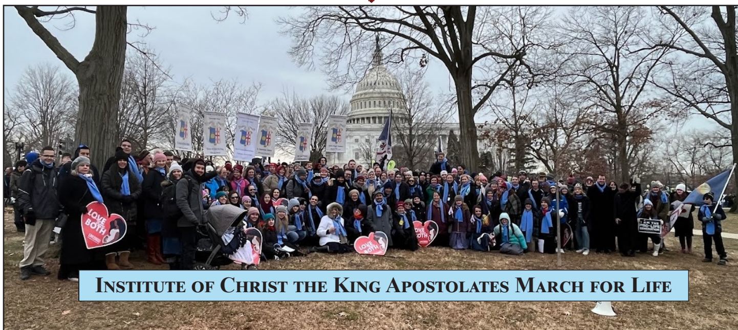
INSTITUTE OF CHRIST THE KING APOSTOLATES MARCH FOR LIFE