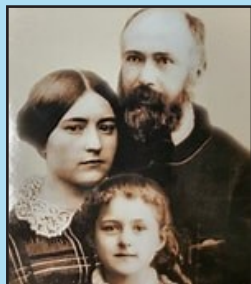
Image of the holy spouses St. Louis and St. Zelig Martin. Parents of St. Therese of Lisieux.