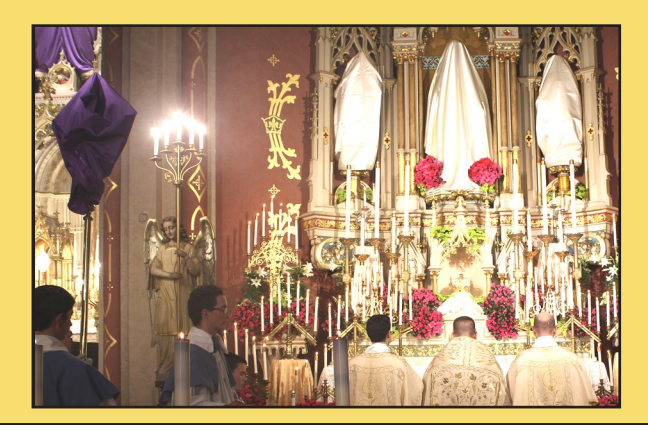
LORD, HAVE MERCY ON ME, A SINNER.

HOLY THURSDAY (Adoration until Midnight) "COULD YOU NOT WATCH ONE HOUR WITH ME?"