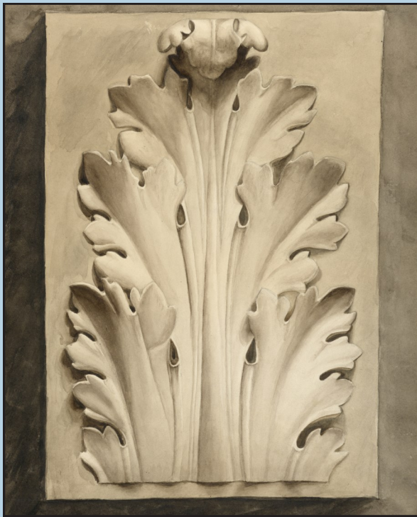
Drawing, Acanthus leaf: from a cast, 1919