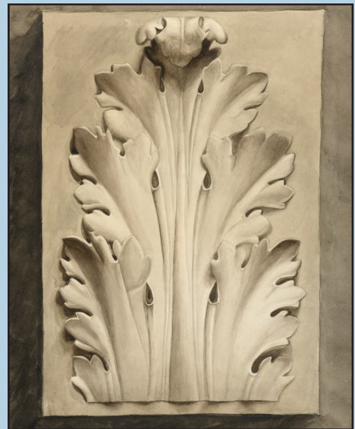
Drawing, Acanthus leaf: from a cast, 1919