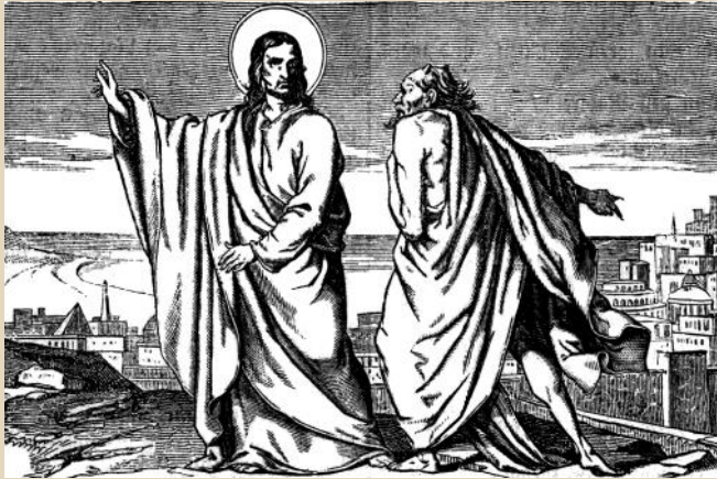
From The Liturgical Year , 1st Sunday of Lent by Dom Gueranger, O.S.B.

VERITATEM FACIENTES IN CARITATE - LIVING THE TRUTH IN CHARITY