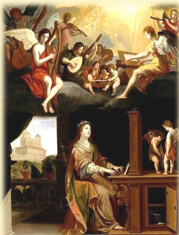
St. Cecilia, ora pro nobis!