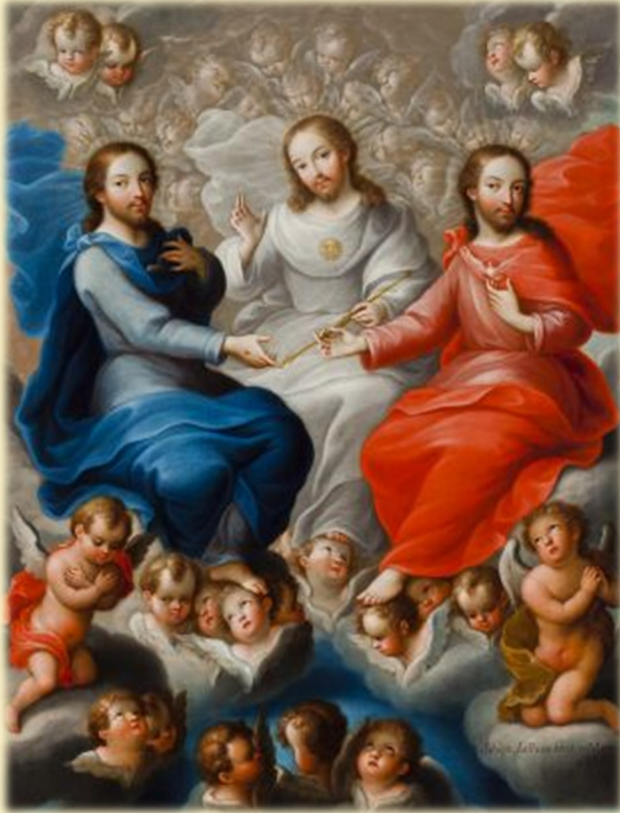
Feast of the Most Holy Trinity

VERITATEM FACIENTES IN CARITATE - LIVING THE TRUTH IN CHARITY