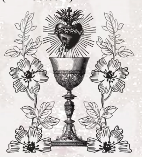
MOST PRECIOUS BLOOD of JESUS PARISH

PARISH NEWS—The parish uses Flocknote to circulate news and information. If you'd like to sign up, please text MPBOJ to 84576 from your cell phone and follow the instructions, or check the parish website ( MPBOJ.com ) for more information.