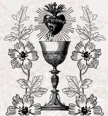
MOST PRECIOUS BLOOD of JESUS PARISH

The pastoral care of Most Precious Blood of Jesus Parish is provided by THE INSTITUTE OF CHRIST THE KING SOVEREIGN PRIEST.