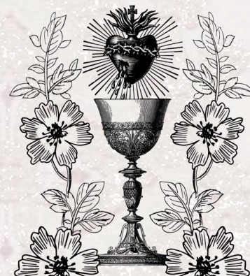
MOST PRECIOUS BLOOD of JESUS PARISH

The pastoral care of Most Precious Blood of Jesus Parish is provided by THE INSTITUTE OF CHRIST THE KING SOVEREIGN PRIEST.