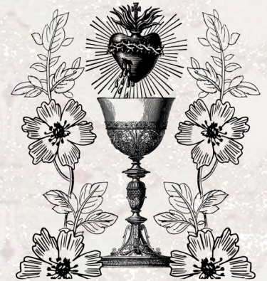
MOST PRECIOUS BLOOD of JESUS PARISH

The pastoral care of Most Precious Blood of Jesus Parish is provided by THE INSTITUTE OF CHRIST THE KING SOVEREIGN PRIEST.