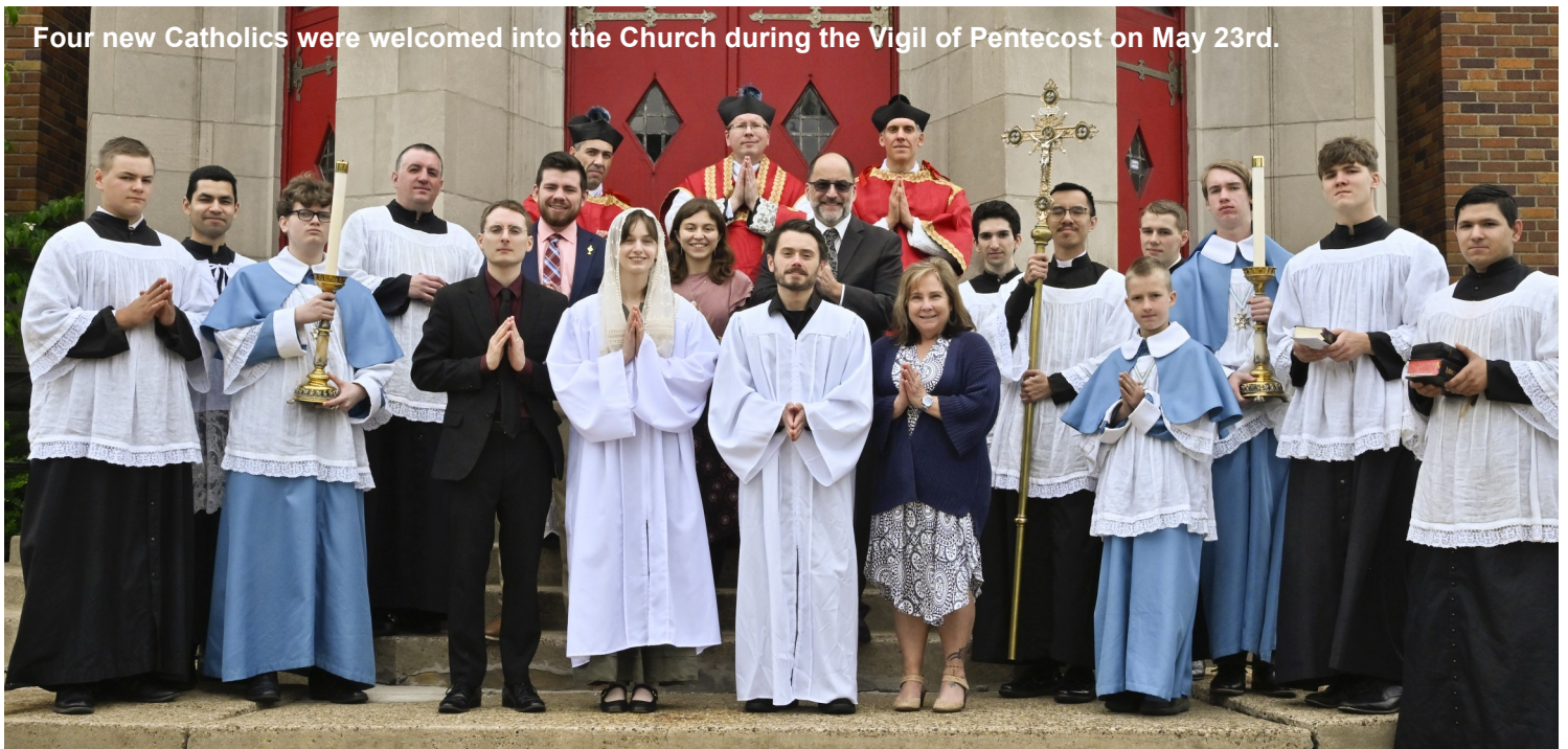
Four new Catholics were welcomed into the Church during the Vigil of Pentecost on May 23rd.

Sacramental Records/Letters of Good Standing: To obtain sacramental records or a letter in good standing, please contact the Parish Office at 412-761-1508 for instructions.