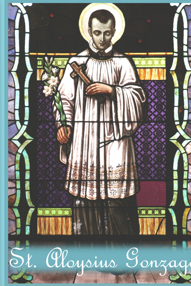
St. Aloysius Gonzaga