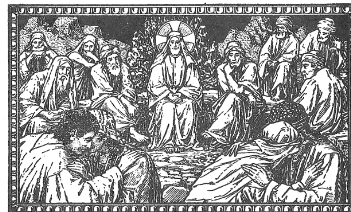
Be reconciled to thy brother