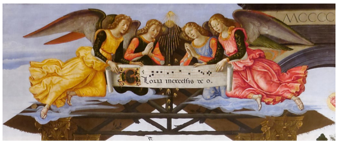
The Catholic Institute of Sacred Music at St. Patrick's Seminary, Menlo Park, California presents an inaugural