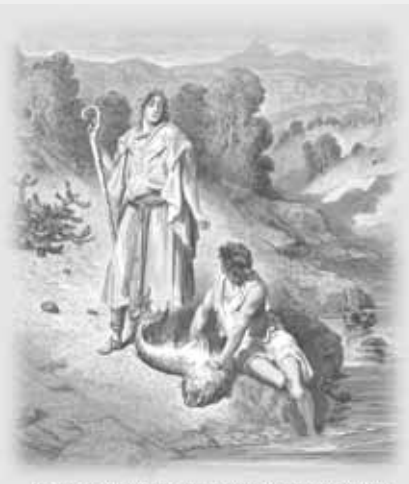
AZARIAS (RAPHAEL) THE TOBIAS THE YOUNGER

R APHAEL is not mentioned by name in the scriptures, except in the Book of Tobias. Here he first appears disguised in human form as the travelling companion of the younger Tobias, calling himself