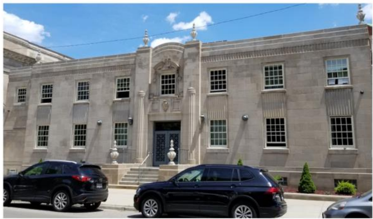
Before & After!