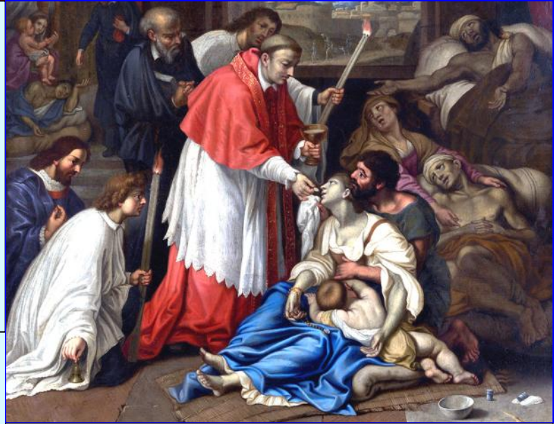
Saint Charles Borromeo Ministering to the Plague Victims by Pierre Mignard (1612-1695) St. Charles Borromeo, pray for us!

http://www.institute-christ-king.org/tucson-home/