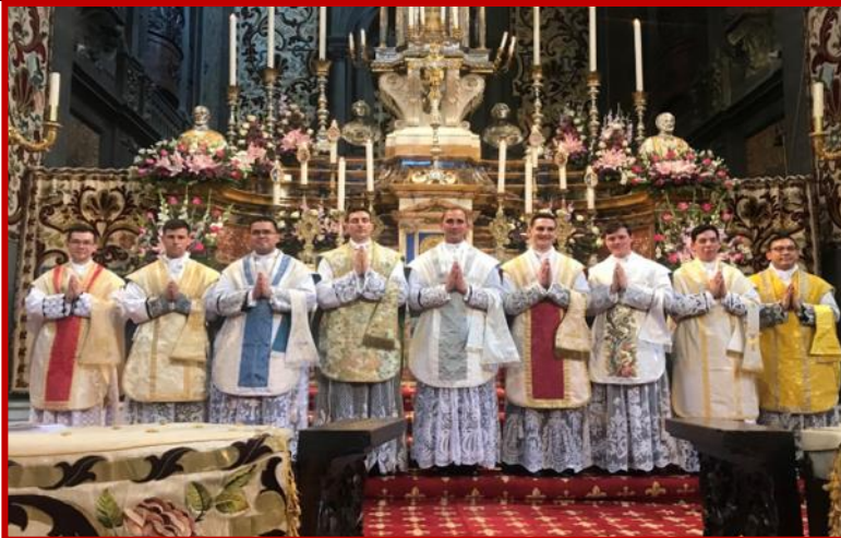
Nine new priests ordained for Holy Mother Church in 2020 at the Institute of Christ the King Church Ss. Michele e Gaetano in Florence, Italy.

Call the office for Anointing of the Sick and for Sick Calls for the homebound.